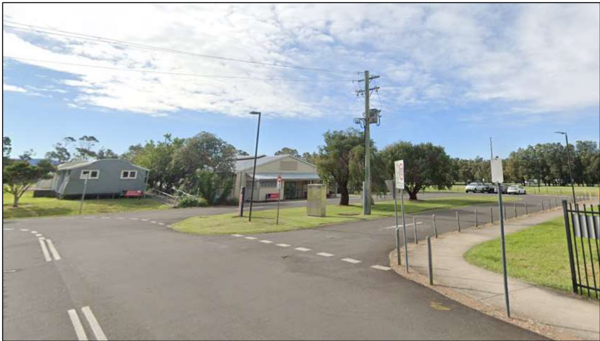
Looking north towards the northern portion of the site - State Heritage listed former Balgownie Migrant Workers' Hostel, comprising a Nissen hut and two Quonset Huts, along with associated car parking area.