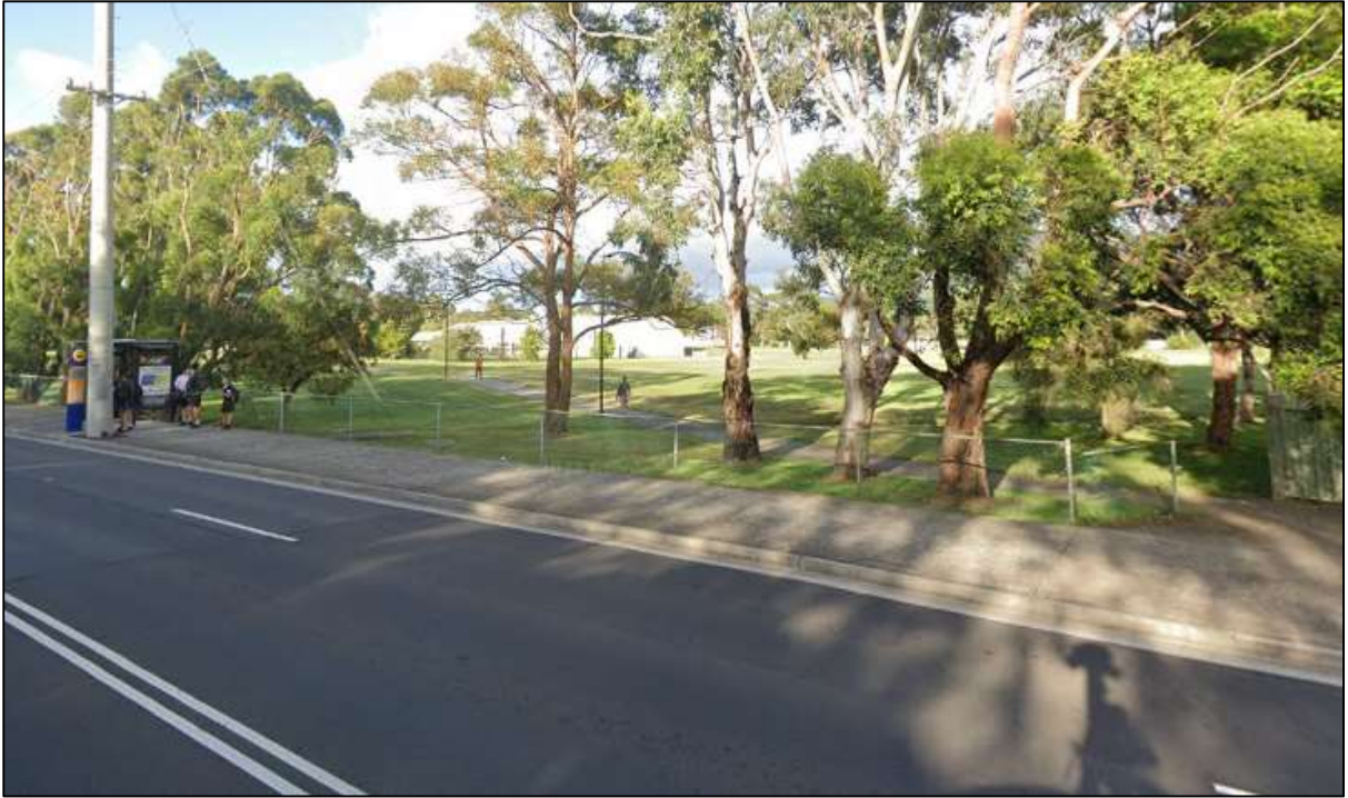
Looking south-west across the northern end of the site; bus stop in the foreground along with the existing pedestrian pathway traversing the site providing pedestrian access to Squires Way