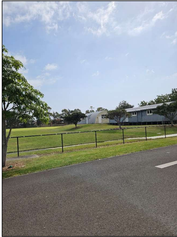
Looking north-east across the location of the community field to the heritage listed huts

Looking north-east towards the location of the proposed CHPC and car park