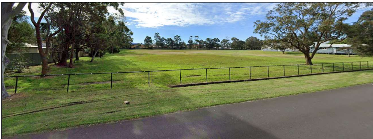
Looking north east across the area of the community field – existing vegetation to boundaries evident.