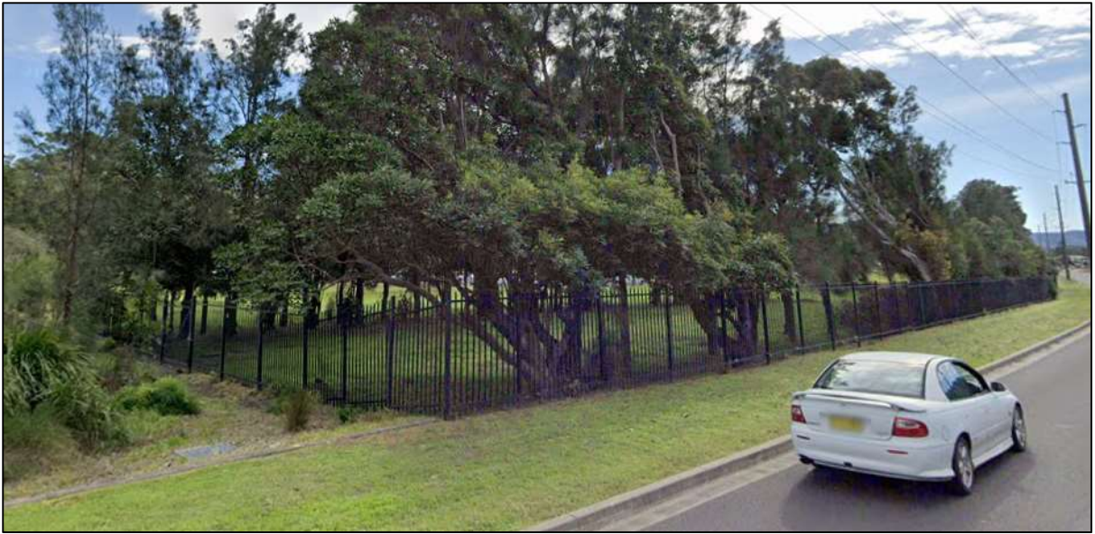
Looking north-west along the Squires Way frontage of the site. Existing vegetation to be retained.