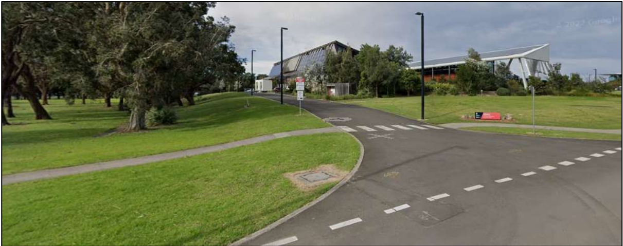
Looking east along the existing access road from which vehicular access will be gained to the CHPC and car park