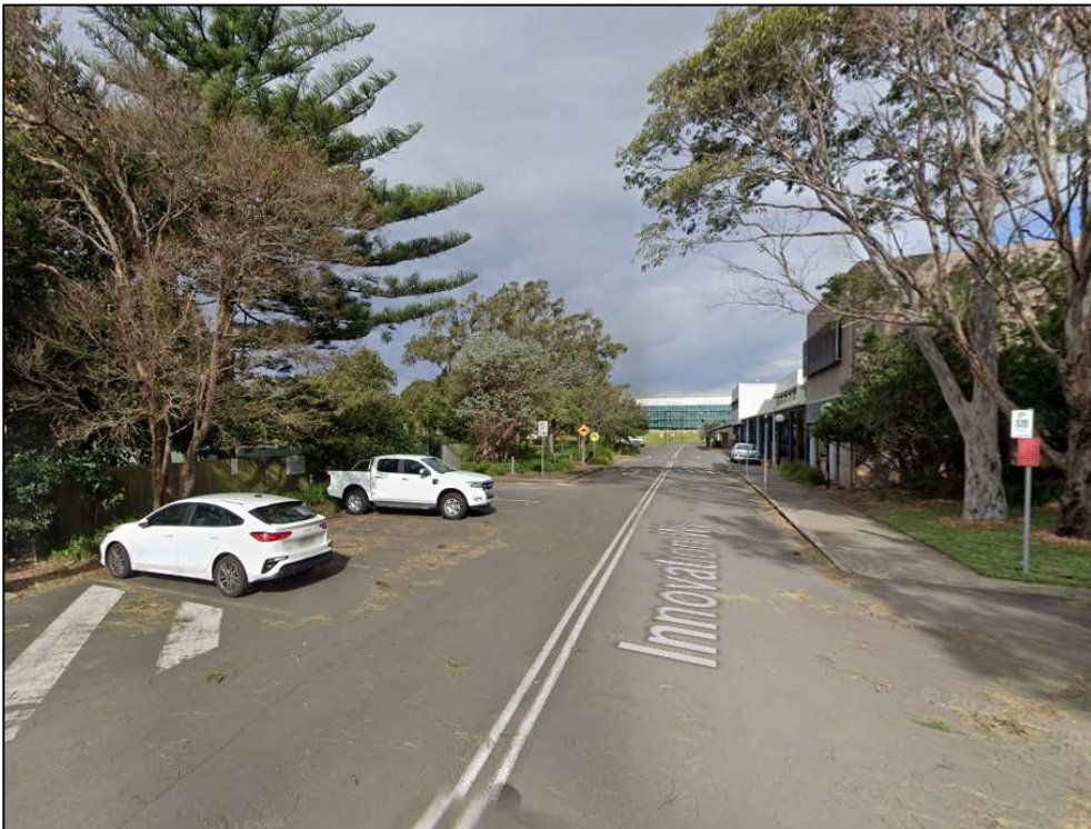
Looking south along Innovation Way to the site and adjacent student accommodation building on the western side of Innovation Way