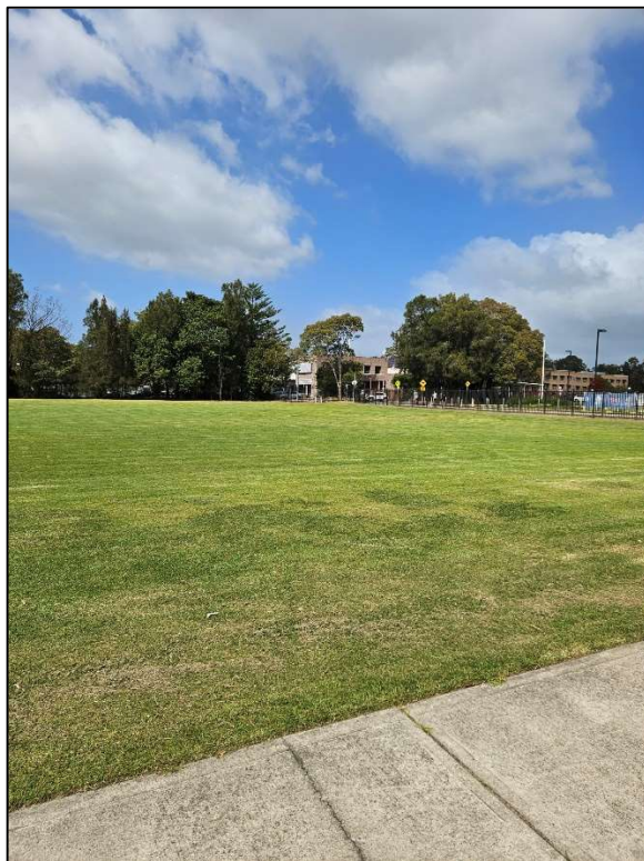
Looking south/ south-west across existing field where Field 1 is proposed