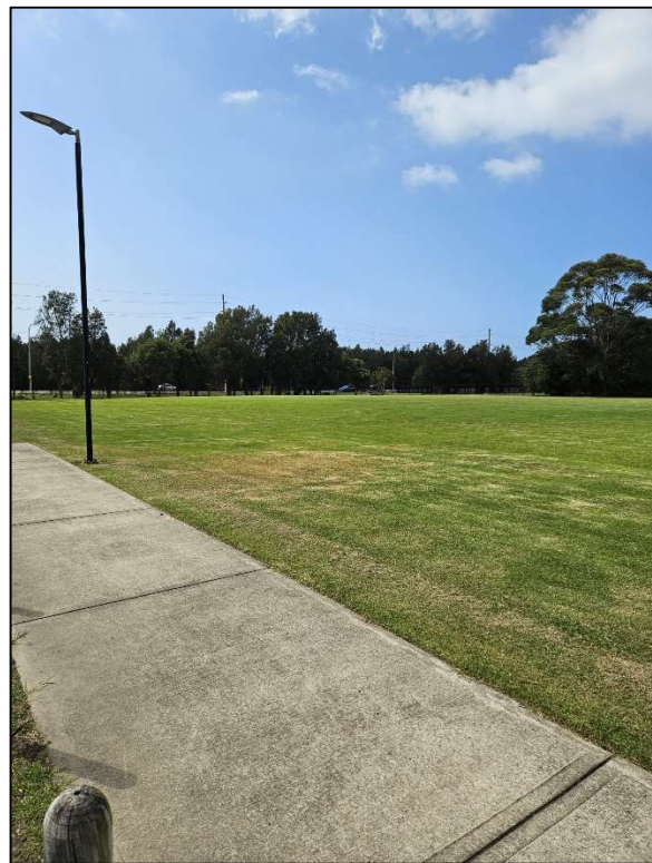
Looking south east across existing field where Field 1 is proposed