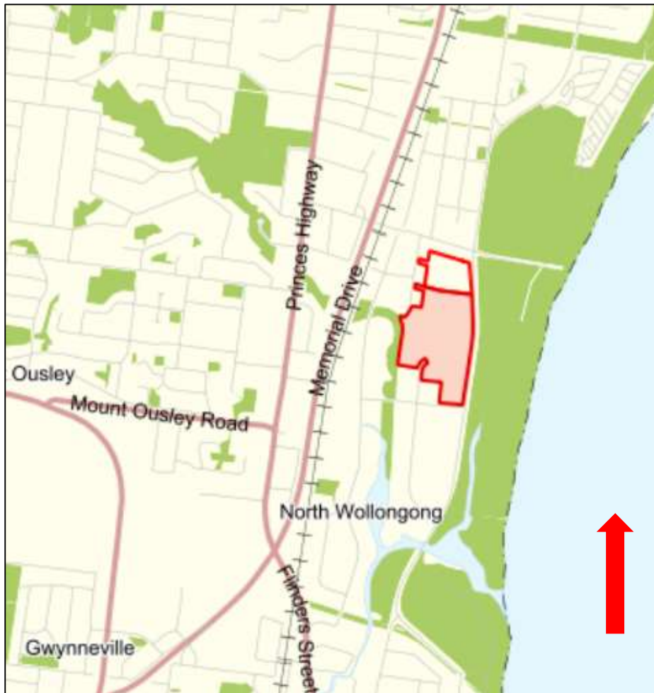
Site outlined in red, within broader locality