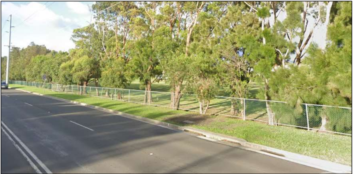
Looking south-west along the Squires Way frontage of the site. Existing vegetation to be retained